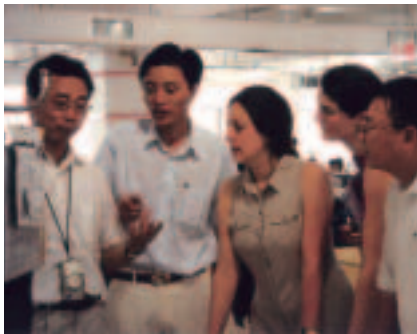
A team from Impactt Ltd and Pentland in China during the project on finding ways to reduce overtime (described on page 7).

Pentland is a founder member of the Ethical Trading Initiative (ETI), created in 1998, and has adopted its Base Code as required by all ETI members. This UK network of companies, NGOs and trade union organisations works to encourage companies to adopt monitored and independently verified codes of conduct. We are currently involved in ETI projects in China and Sri Lanka ( described on page 6 ). We are members of the International Business Leaders Forum (IBLF) and they are one of our partners in a continuing project in Vietnam ( described on page 8 ).