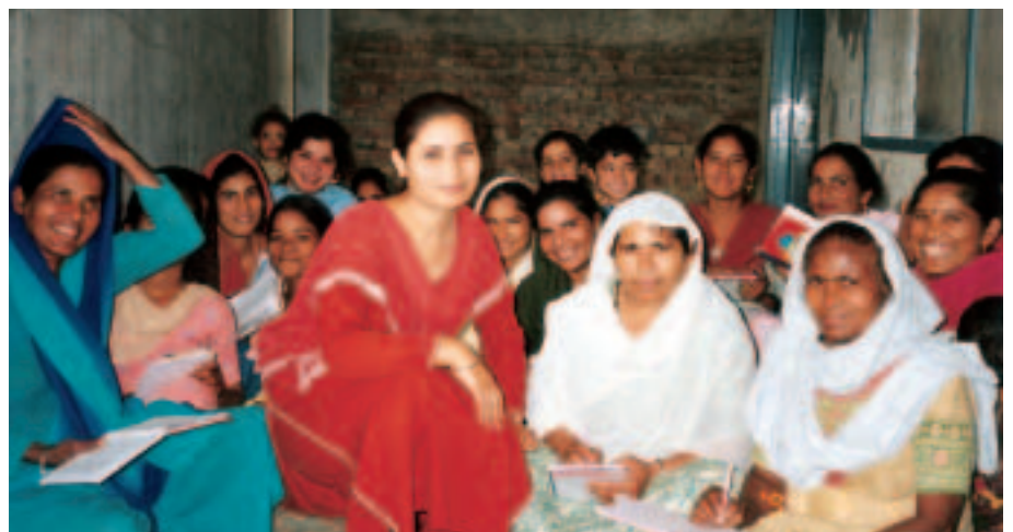
Women attending a literacy class in India, part of the project initiated by the Sports Goods Foundation of India and supported by Pentland.

The programme includes schools, evening tuition centres to help with homework and now literacy classes for adults, this in response to mothers who want to be able to sign their names – learning basic literacy skills increases their confidence as well as their involvement in their children’s education. We facilitated the necessary partnerships between the Foundation and the international and regional NGOs as well as a monitoring organisation.