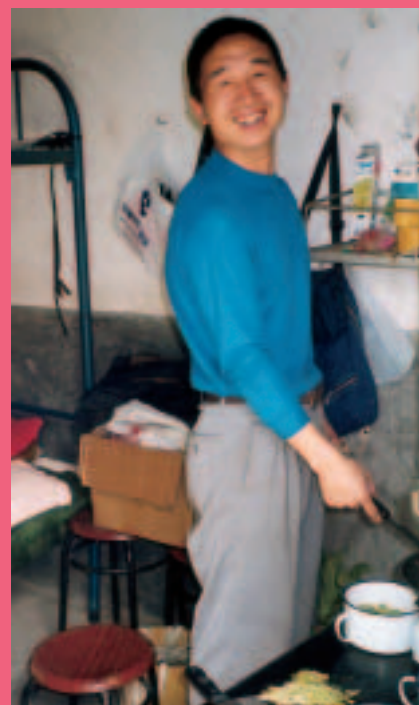
A worker enjoys his time off in his dormitory at a factory in south China.