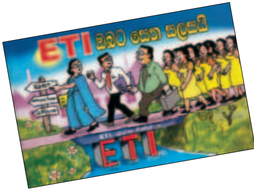
From the booklet about the ETI Base Code produced for workers in Sri Lanka – the worker is saying: Now we understand that this [ETI Base Code] would benefit everyone.