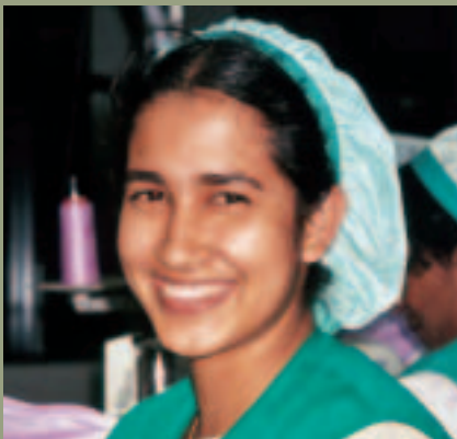
Cover Image: Team leader in a stitching department, Sri Lanka.