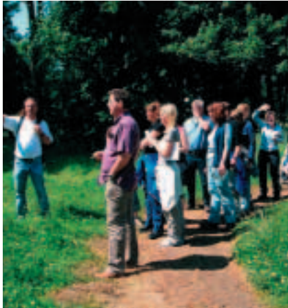
As an initiative to motivate staff in reducing our environmental impact, a Pentland operating company has organised nature walks in the countryside near their office.