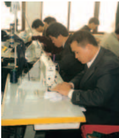
Stitching in a garment factory in China.

“Our experience with the Global Compact over the past four years has shown conclusively that voluntary initiatives can and do work. But we have also learned that they have to be made to work”.