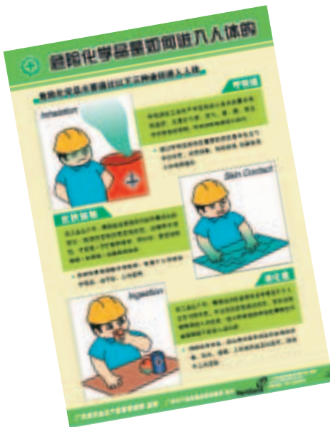
Three ways hazardous chemicals can enter the body, one of a series of Chinese health and safety posters, a joint project with the Guangdong Province Safety Inspection Bureau.

Our Business Standards department works with operating companies and suppliers to identify the critical areas in a factory that need improvement, to secure external training if necessary and to monitor implementation of the agreed changes. In China, for instance, we have arranged for the local Red Cross to provide training on first aid.