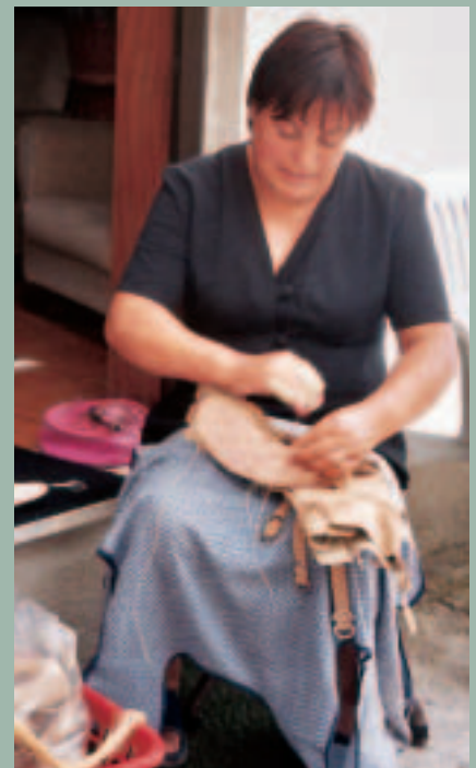
A homeworker in north Portugal stitches shoes for Kickers, a Pentland operating company.