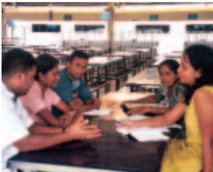
Representatives from the local NGO CENWOR (Centre for Women's Research), pictured right, conducting interviews with workers in Sri Lanka.