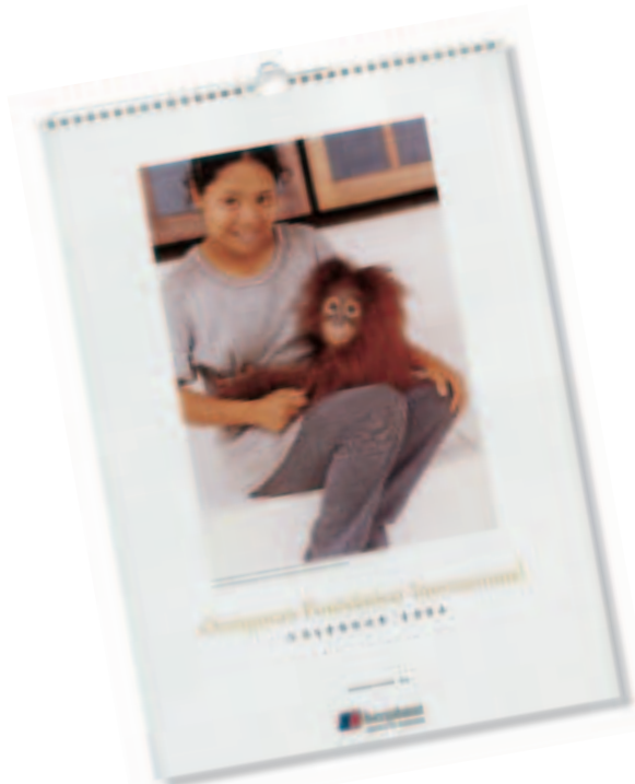
Front cover of the Orangutan Foundation's 2004 calendar, financed by Berghaus, a Pentland operating company.

We encourage our operating companies to look at their environmental impact worldwide, their 'footprint', and work to reduce it. Since transport forms a substantial part of this footprint, we send goods by sea and rail as much as possible. We have also invested in video conferencing facilities in the UK and Asia to reduce air travel. Our work on reducing the use of organic solvents ( described on page 8 ) is part of this effort.