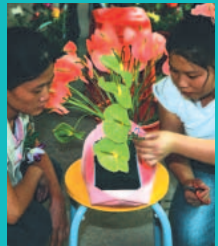
Factory workers in China arranging plants at a workshop sponsored by the British Council.