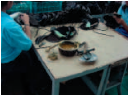
Fumes escape from this open glue container into the air that workers breathe.