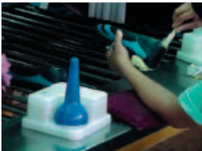
This glue pot, promoted by Pentland with its suppliers, can be kept closed.

BUSINESSES ARE ASKED SUPPORT A PRECAUTIONARY APPROACH TO ENVIRONMENTAL CHALLENGES, ... ENCOURAGE THE DEVELOPMENT AND DIFFUSION OF ENVIRONMENTALLY FRIENDLY TECHNOLOGIES - UN GLOBAL COMPACT